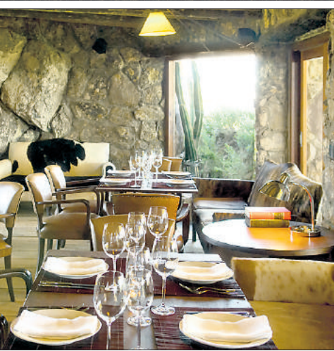
Stunning settings: clockwise from left, dining area at Fasano Las Piedras, Punta del Este; Playa Vik José Ignacio; Hotel das Cataratas, Iguazú Falls; Rio de Janeiro

The bohemian village of José Ignacio is home to the new Playa Vik resort – a must for lovers of art and architecture