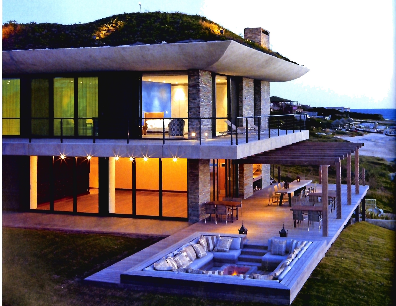
One of the six stone and wood casitas that dot the "L" shaped resort. Fully retractable windows slide into the walls allowing the rooms to become one with the private gardens and open out to an outdoor terrace and barbecue area. The curved top hosts a living roof that adds to the architectural statement of the building