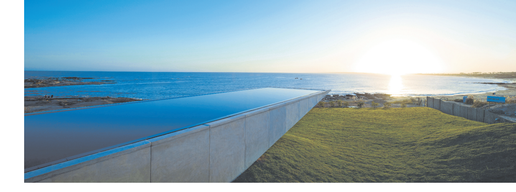
From Top At 32 feet above the garden, a swim to the tip of the 75 foot cantilevered pool in black Nero granite guarantees an even more spectacular view of the sunset; Rough-hewn lapacho floors and comfortable seating around the traditional brasero (fire pit) make the terrace a popular meeting spot for souls eager to enjoy the vistas and delicious barbecues Left An oversized, stand-alone beech wood bathtub sits in harmony with the overall minimalist bathroom, while double mirrors maximise the panoramic views outside

Six small casas surround the "sculpture" building in an "L" shaped pavilion. Large bougainvilleas grow towards the living roof dotted with local wild flowers. Retractable windows lead out to private gardens, while a fireplace, ebony macassar ceilings and handpainted floors create a cosy nook inside. To save space, a playroom, gym, spa and 40 foot wine cellar have been carved out beneath the casas. An indoor eatery with a unique stone divider made of Agatha stone pebbles and rough-hewn lapacho floors lead out to the terrace that conveniently sits next to the beach. Seating close to 60 guests, a large log of cinnamon wood functions as a table allowing a traditional fire pit to take centre stage. Use of solar and wind technology, recycled water and maximisation of natural ventilation are just some of the steps the luxurious haven has taken towards being self sustaining. •