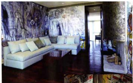
Clockwise from above: Musso Suite, Estancia Vik; Casa Raices Exodus living room, Playa Vik; the asado area, Estancia Vik; wooden tub in the Vik master suite; entrance to the living room at Estancia Vik. Previous page: Playa Vik exterior