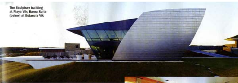
The Sculpture building at Playa Vik; Barea Suite (below) at Estancia Vik

blocks. The goal is to produce a wine that is holistic, harmonious, balanced and seamless. A hotel is currently under construction along with a state-of-the-art winery.