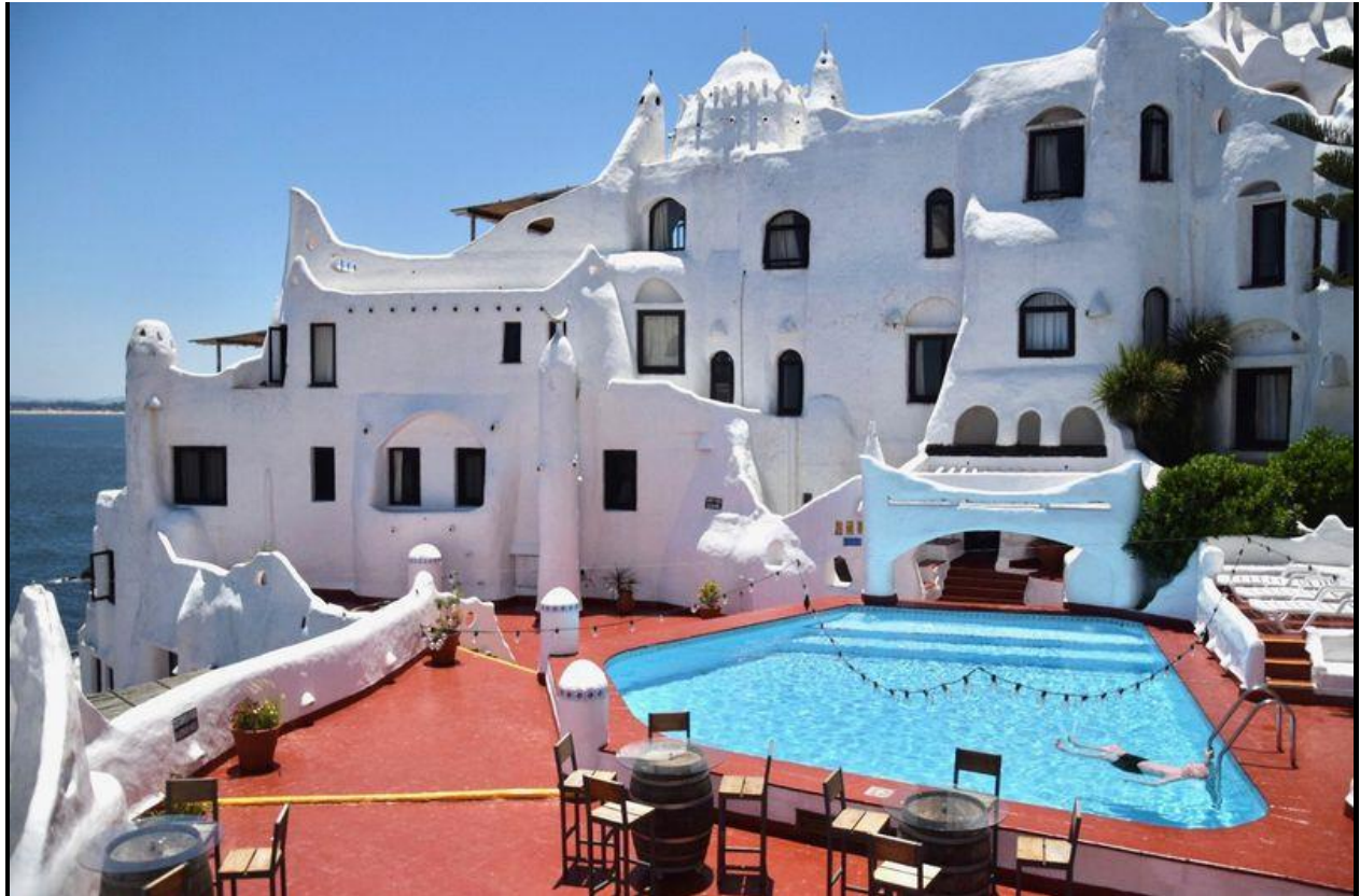
Casapueblo is a rambling hotel and museum constructed by Uruguayan artist Carlos Páez Vilaró in Punta Ballena.