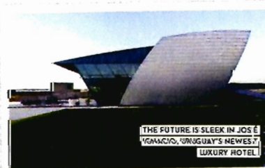
THE FUTURE IS SLEEK IN JOSÉ IGNACIO, URUGUAY'S NEWEST LUXURY HOTEL

Casas from £490 per night, including breakfast; playavik.com. British Airways flies to Montevideo via Buenos Aires; ba.com