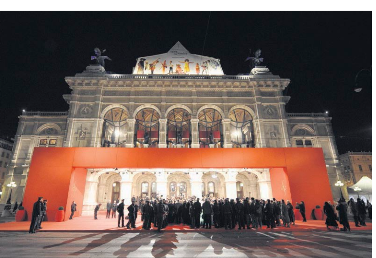
Vienna's State Opera during a traditional ball.