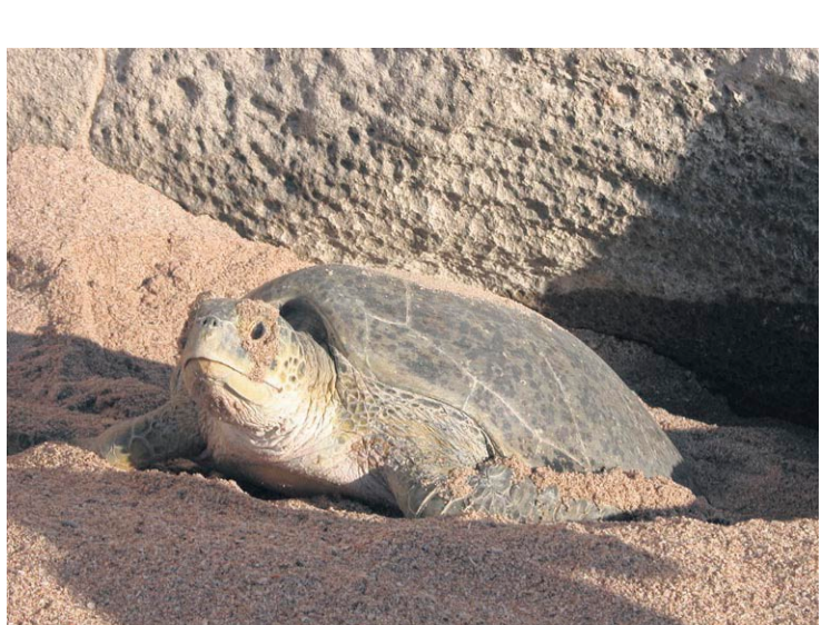
Follow the turtles to Oman's beaches.