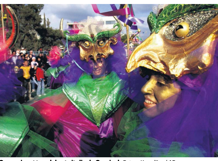
Cyprus is set to celebrate its lively Carnival.