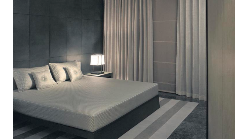
The new Armani Hotel opens in Burj Khalifa.

hes through in February, and in keeping with the pace of today's fashion world, most of the ultra hot outfits parading the catwalk at the start of the week will be out-ofdate by the weekend. The glamour on show at the Victoria and Albert Museum (www.vam.ac.uk; 0044 207 942 2211) in April, by contrast, is timeless. The wardrobe of Grace Kelly, the 1950s Hollywood star who became a real-life princess, goes on display on April 17. The exhibition will feature dresses from