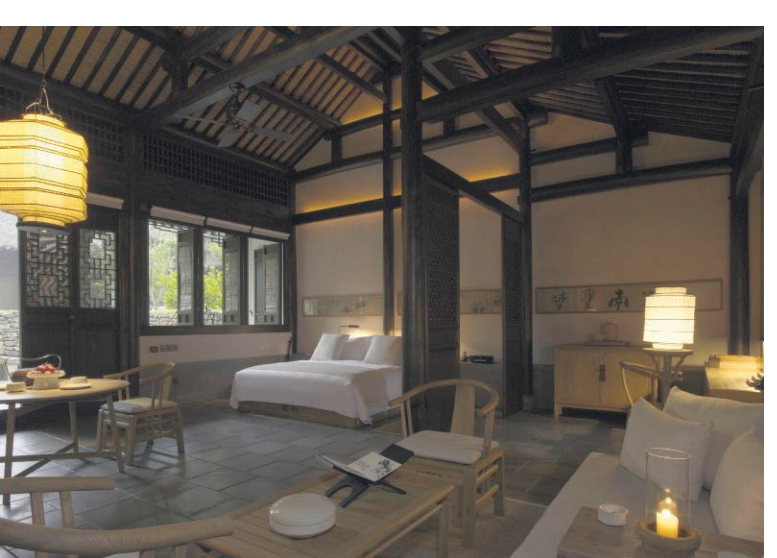
The new Amanfayun in Hangzhou, Courtesy Amanresorts