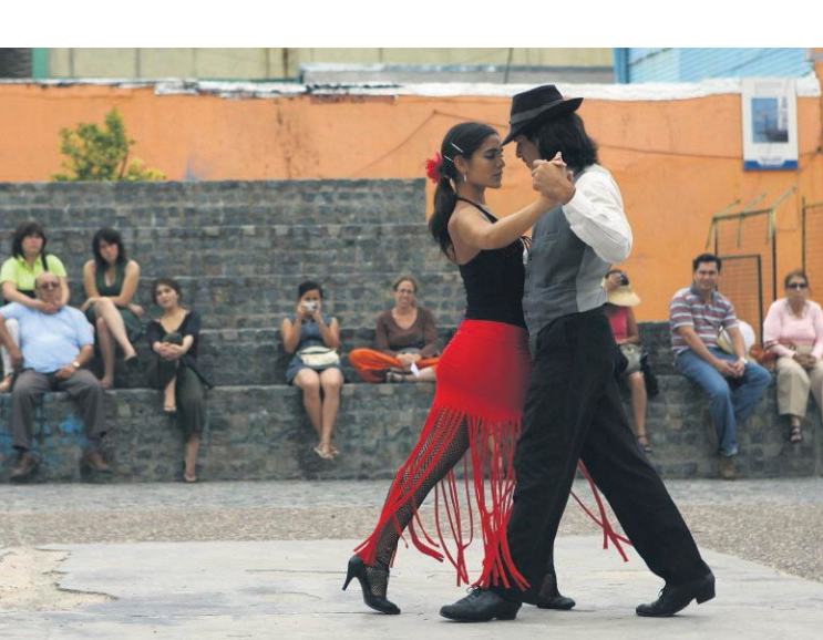
It's always time to tango in Buenos Aires.