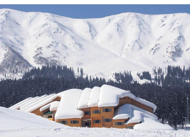
There's plenty of snow at the ski resort in Gulmarg.